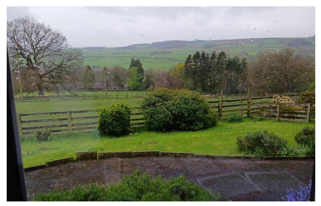
The View from our retreat centre -a bit rainy in the afternoon but ok most of the day!

The urgency of the Climate Emergency can sometimes feel overwhelming. There are so many calls for action. The changes required to ameliorate the worst effects are huge – and require international political action. In these circumstances it is easy for people to lose hope.